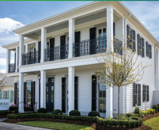
Onshore Construction Company, LLC