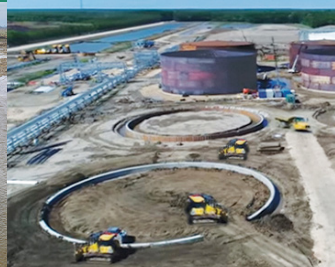
Onshore North / OSN