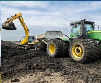
Onshore Materials, LLC