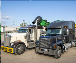
4-Aces Logistics, LLC