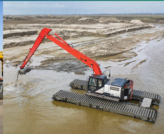
Shallow Water Equipment, LLC