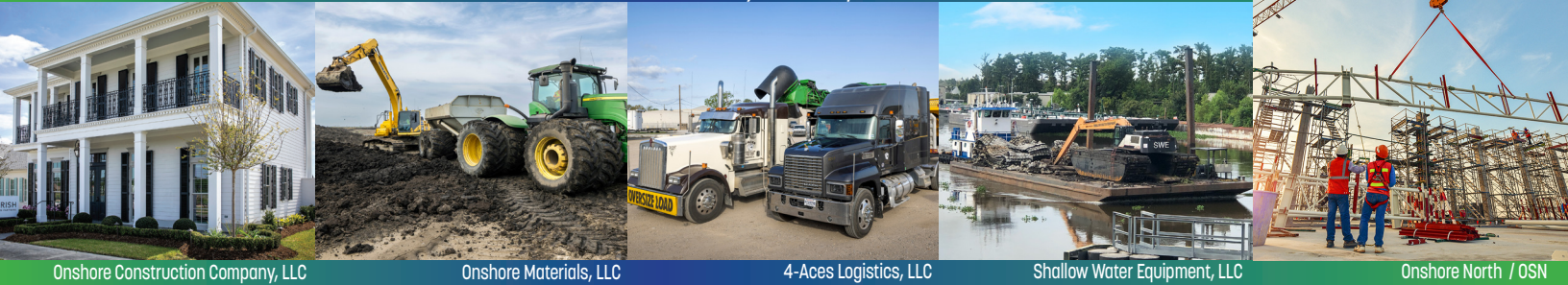
Onshore Construction Company, LLC