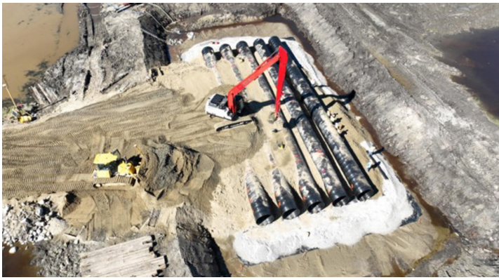
Setting 72" Culverts at 105 in Laplace