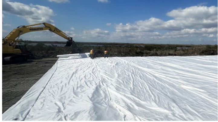
Reach E Fabric Installation

Crews at Reach E continue to push forward with the completion of the original scope and the new challenges which accompany our new scope. In addition to placing fill, crews have degraded several sections and work to install reinforcement fabric prior to raising the levee.