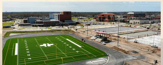
TRMC Outdoor Wellness Center

Everyone at Onshore Companies is working to improve the lives of our friends and families through our work.