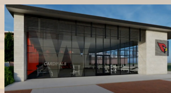
E.D. White High Training Center