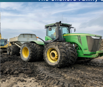
Onshore Materials, LLC