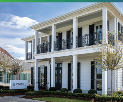
Onshore Construction Company, LLC