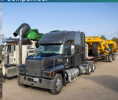
4-Aces Logistics, LLC