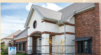
Psychological Health Care of South LA